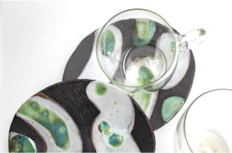
Nom nom i- early spring 早春, stoneware, glass, plates*2 glasses*2, 2024