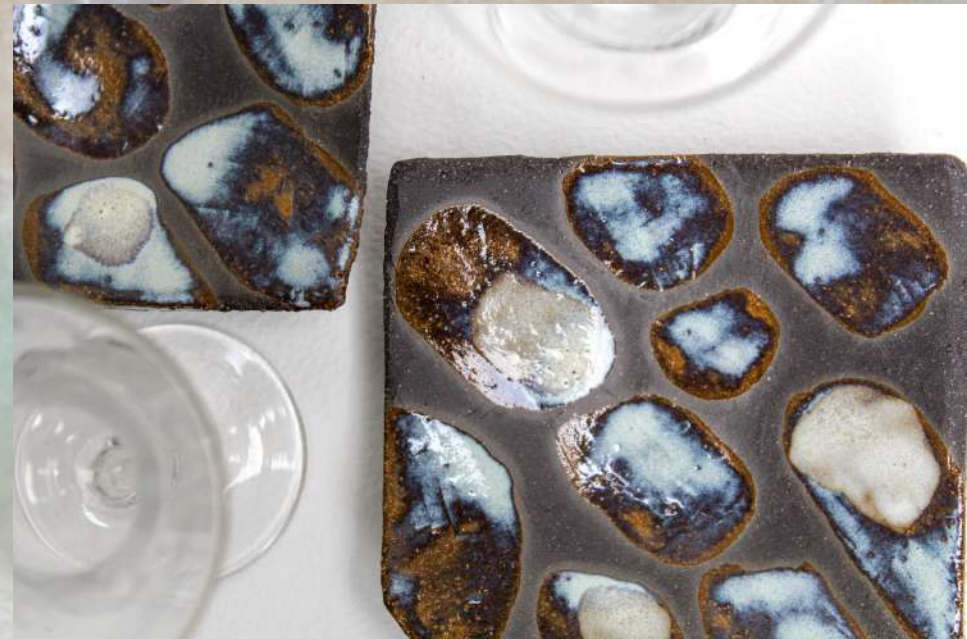
Nom nom iii- comet 彗星, stoneware, glass, plates*2 glasses*2, 2024