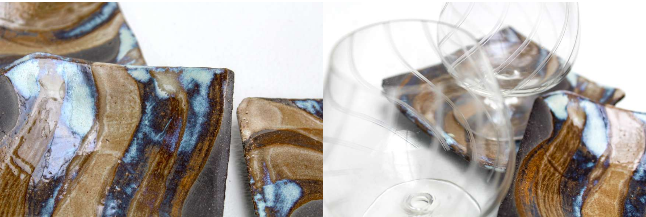
Nom nom ii- qu 曲, stoneware, glass, plates*3 glasses*3, 2024