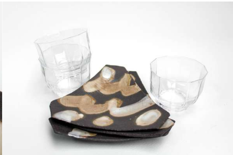
Nom nom iv- yue 岳, stoneware, glass, plates*3 glasses*3, 2024