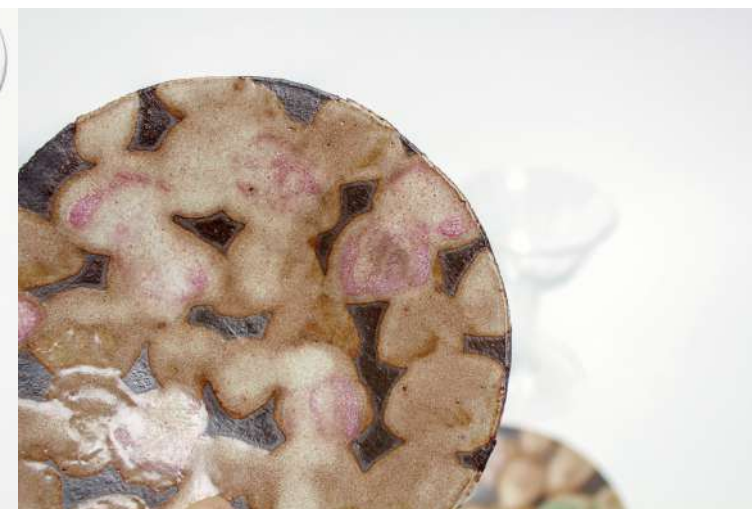
Nom nom vi- cong 叢, stoneware, glass, plates*2 glasses*2, 2024