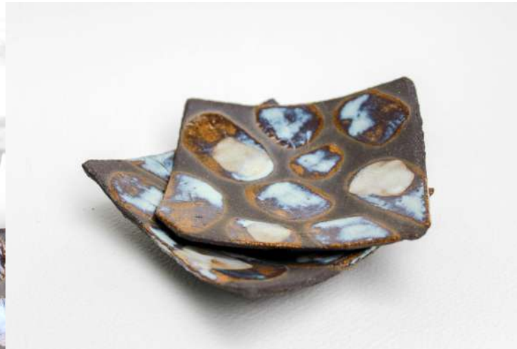
Nom nom iii- comet 彗星, stoneware, glass, plates*2 glasses*2, 2024