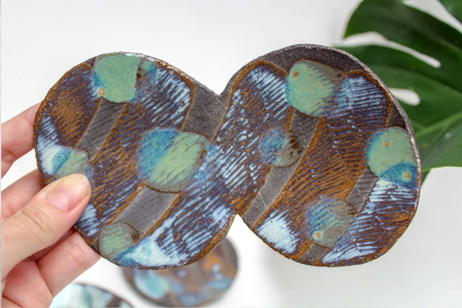
Nom nom vii- meteor 流星, stoneware, glass, plates*3 glasses*2, 2024