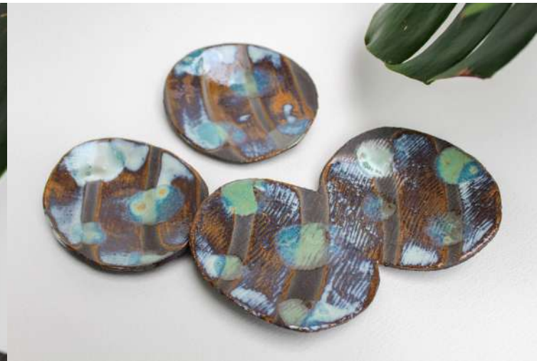
Nom nom vii- meteor 流星, stoneware, glass, plates*3 glasses*2, 2024

to purchase or collect, please contact I Yen Chen Studio directly