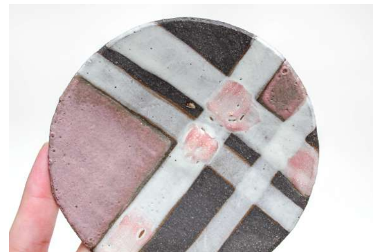
Nom nom v- grid 格, stoneware, glass, plates*3 glasses*2, 2024