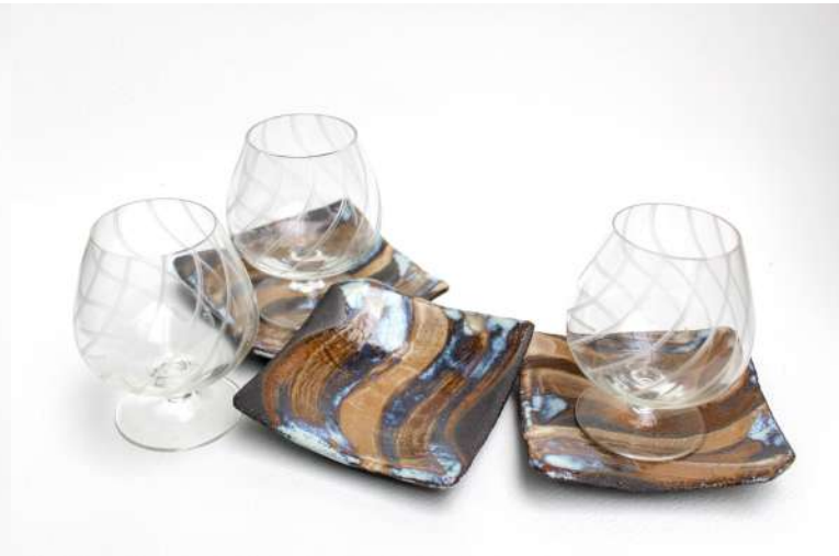
Nom nom ii- qu 曲, stoneware, glass, plates*3 glasses*3, 2024