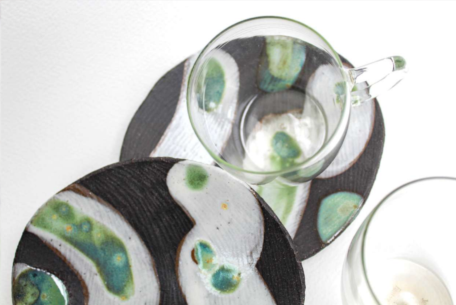
Nom nom i- early spring 早春, stoneware, glass, plates*2 glasses*2, 2024